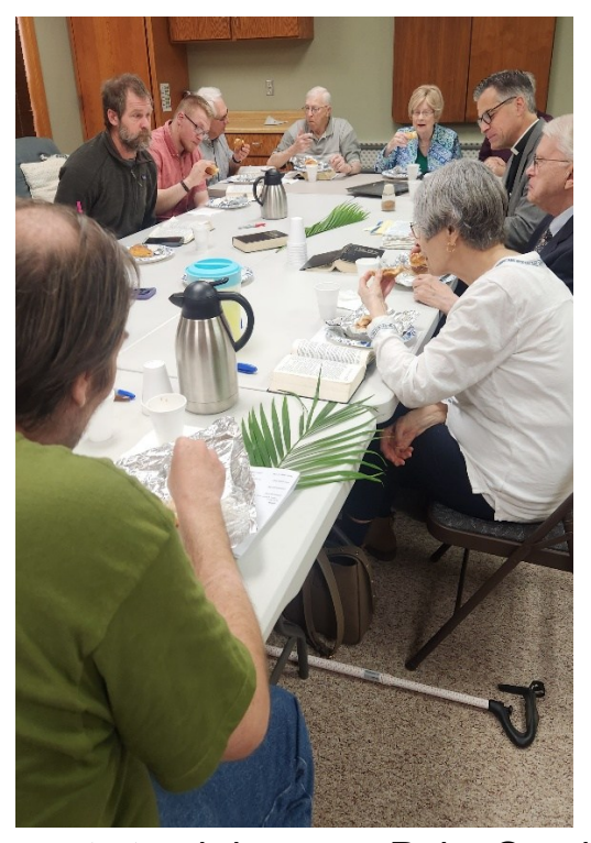
The Adult Bible Study participants made empty tomb buns on Palm Sunday, in anticipation of Easter Sunday. They turned out pretty well!