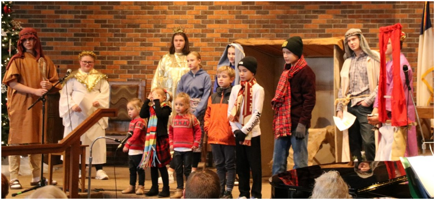
Advent Fun Hour on December 15 – FUN TIME!